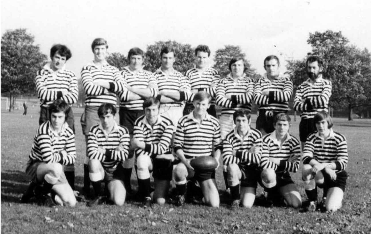
Leeds Chirons 1971