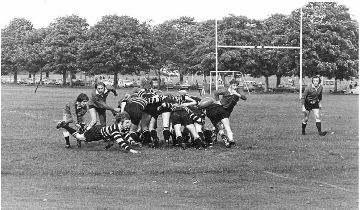
Leeds Chirons v Leeds Corinthians September 1973