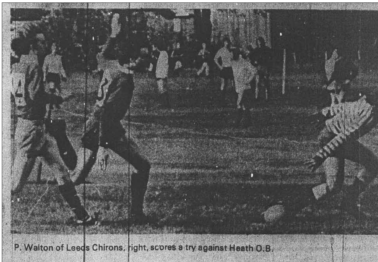
Leeds Chirons 'A' v Heath Old Boys 'A' P Walton October 1972