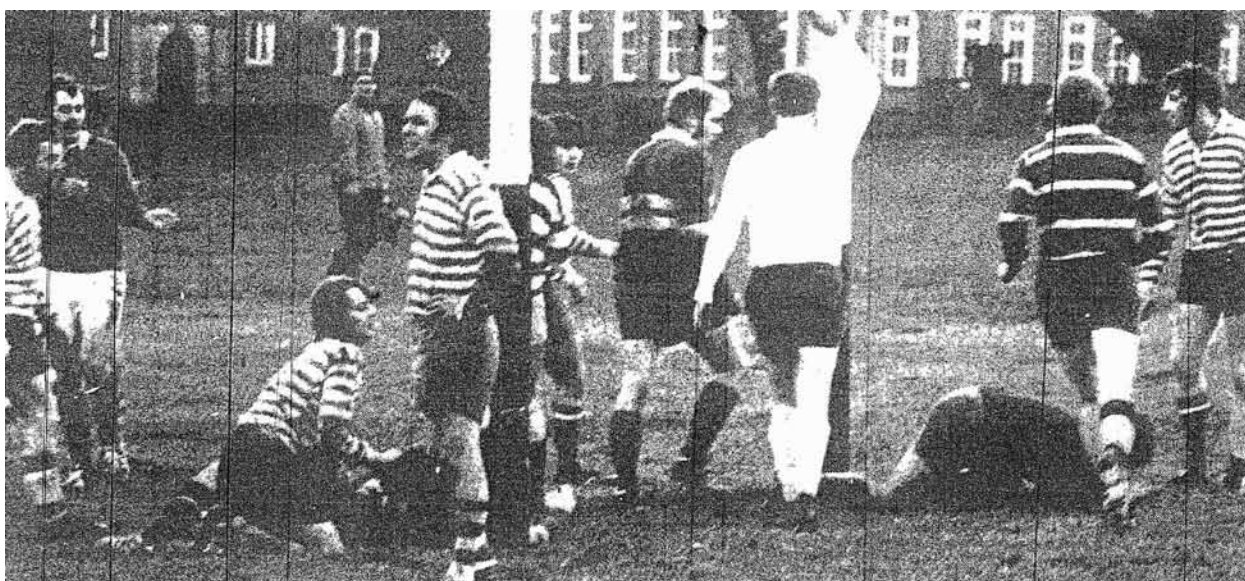
Chirons 'A' v Halifax Vandals 'A' November 1972