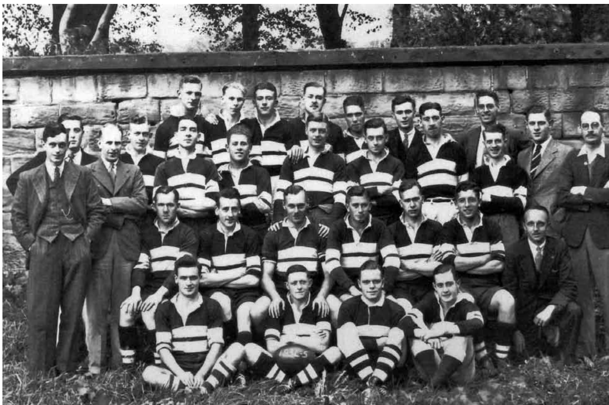
Leeds Chirons 1934