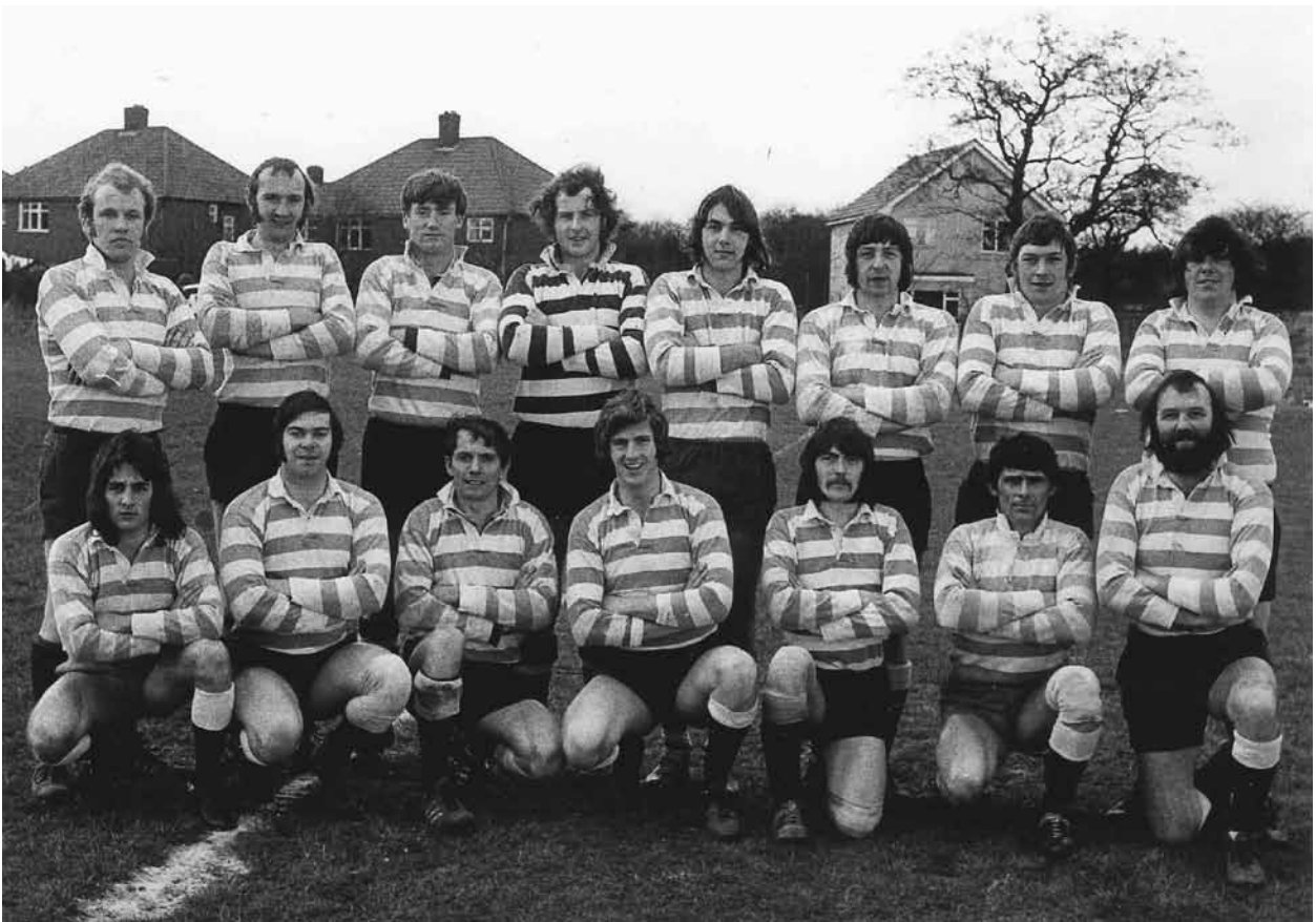
Leeds Chirons 1972