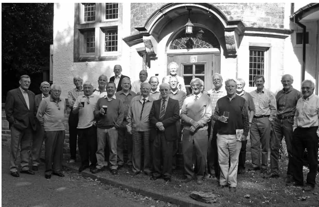
Leeds Chirons 2011 - Reunion